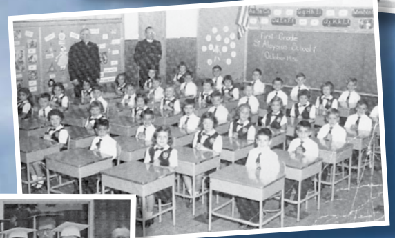
1956 First Grade Class

Pictures from the centennial celebration book "Saint Aloysius Church 1896-1996"