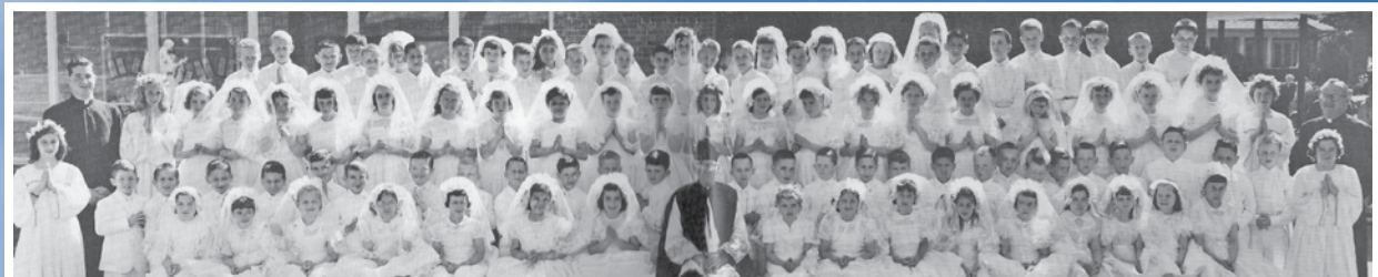
1959 First Communion Celebration