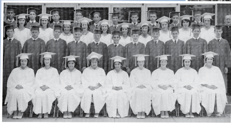
1961 First Graduating Class